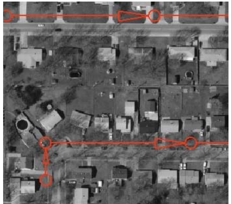
Figure B. Minor swim is evident in vector data created from a high accuracy source and overlaid with newer high accuracy orthophotography. This minor variation is normal and should be anticipated and acceptable for most uses of the data.

In another example, data that were collected using high accuracy techniques - like GPS, map or survey grade - may be more accurate than previously available source data. If your point data was corrected or moved to line up on less accurate photos, once you start using the 2005 orthophotos the points might not show up in the right place.